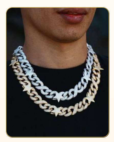
HANDMADE & HIP-HOP JEWELRY Bold, cultural pieces crafted to express your vibe.