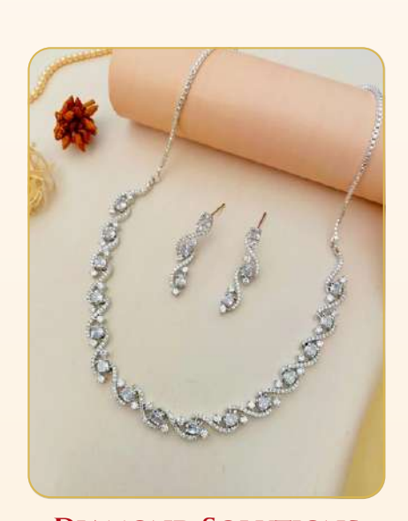
DIAMOND SOLUTIONS GIA/IGI graded diamonds just for you