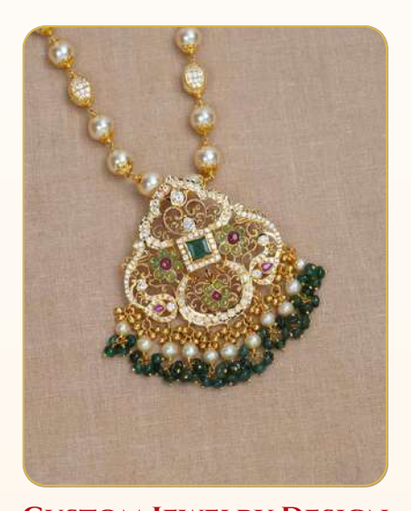
CUSTOM JEWELRY DESIGN From sketch to stone, we bring your idea to life.